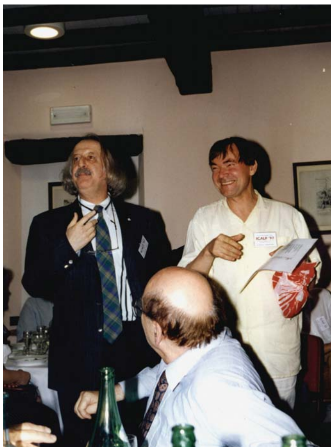
at the EATCS General assembly in Bologna Jul 09 1997