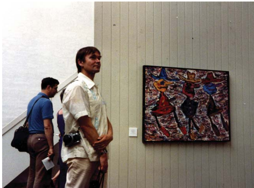
at excursion ICALP Aarhus Jul 14 1982