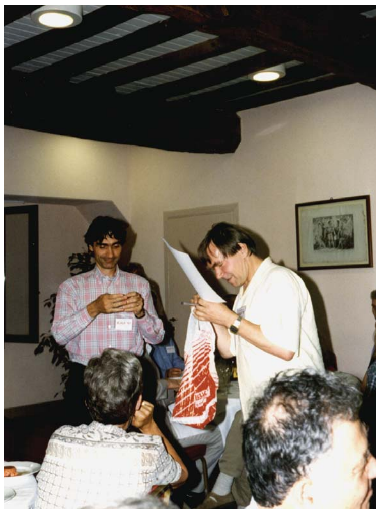
at the EATCS General assembly in Bologna Jul 09 1997