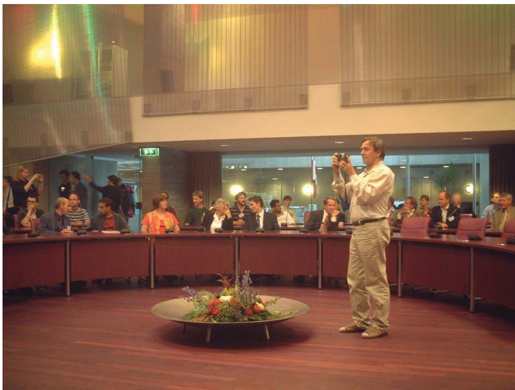
at ICALP 2003 in Eindhoven