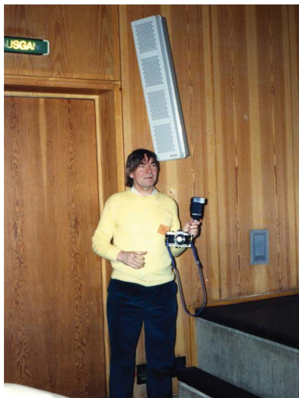
at STACS 1991 in Hamburg